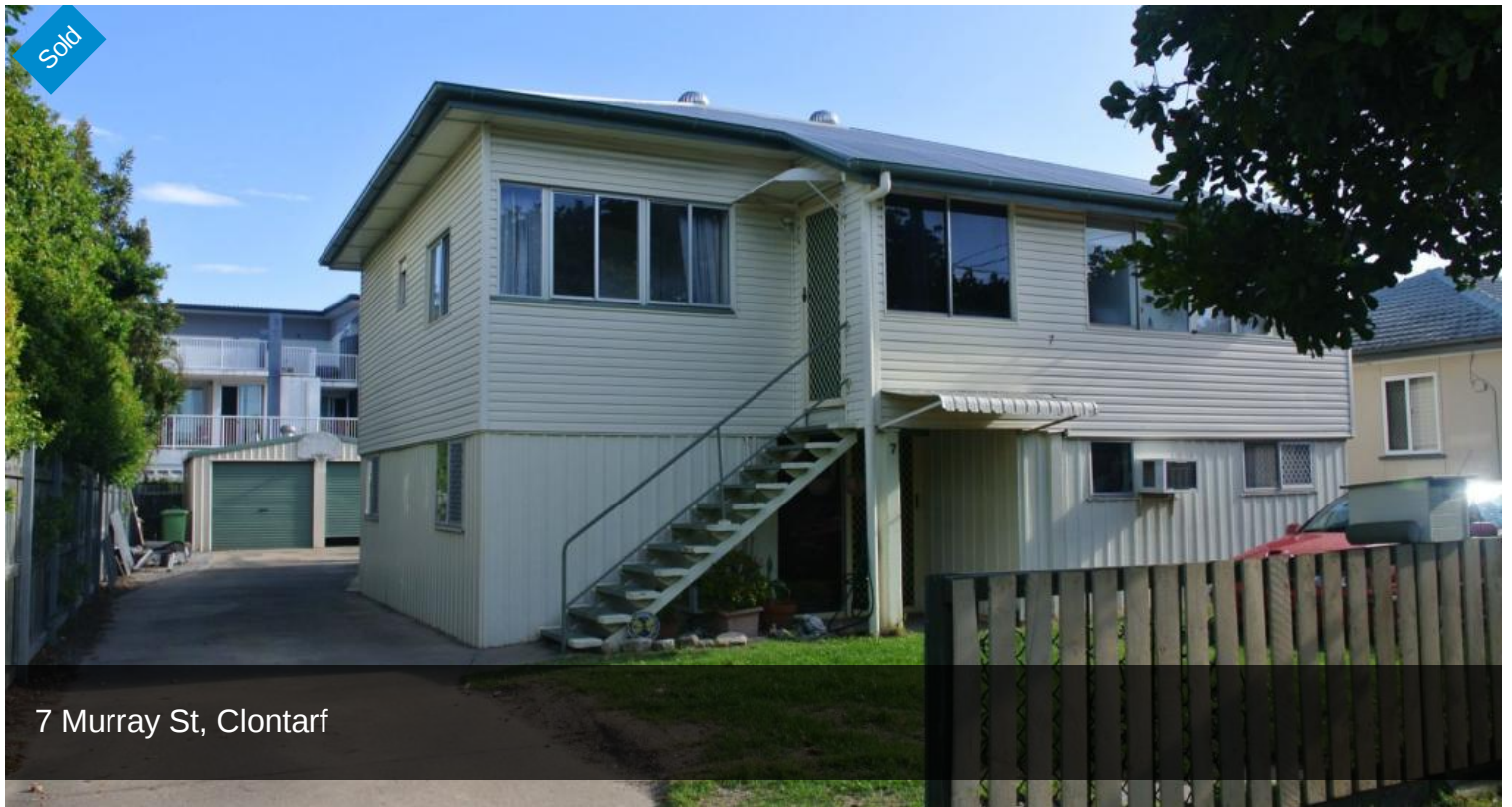
7 Murray St, Clontarf