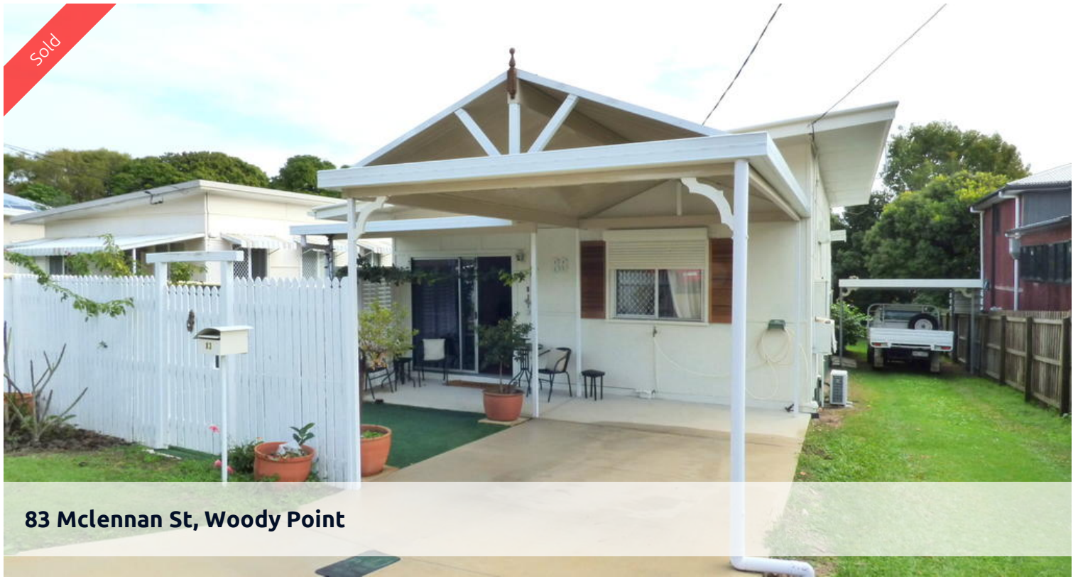
83 McLennan St, Woody Point