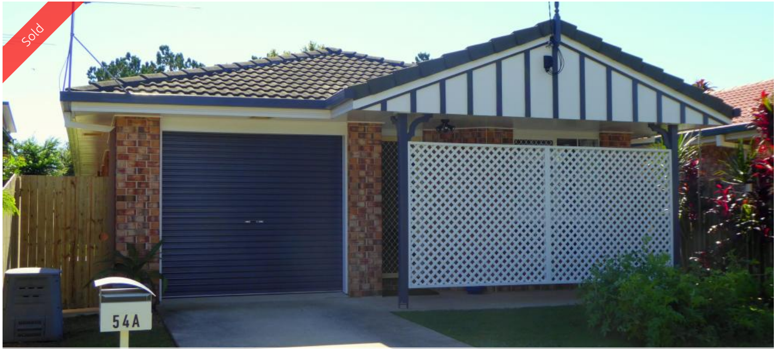
54A Dunbar St, Margate