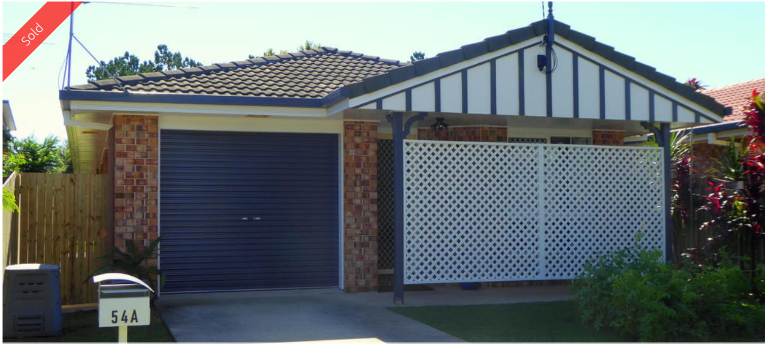
54A Dunbar St, Margate