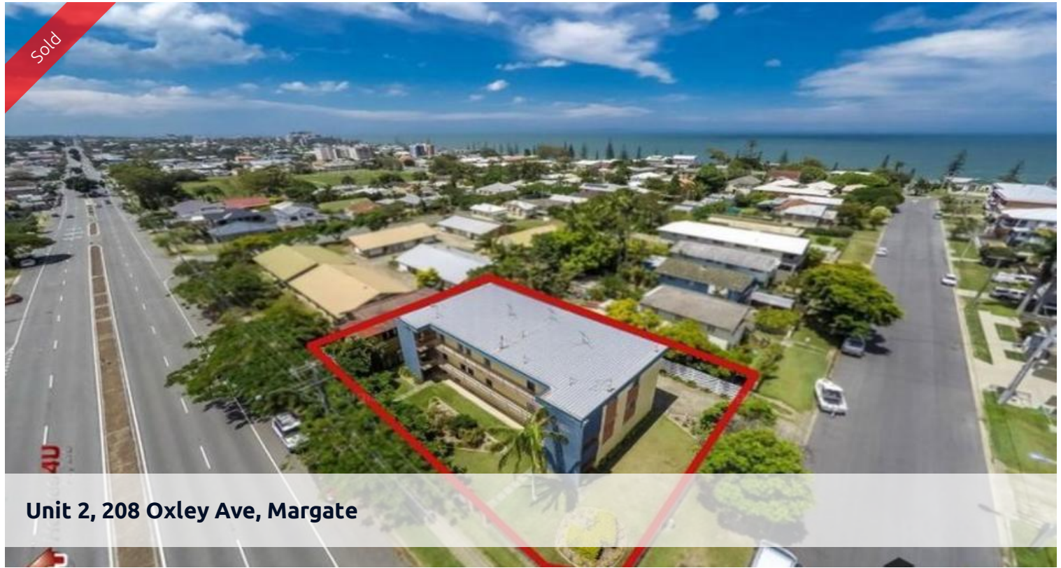
Unit 2, 208 Oxley Ave, Margate