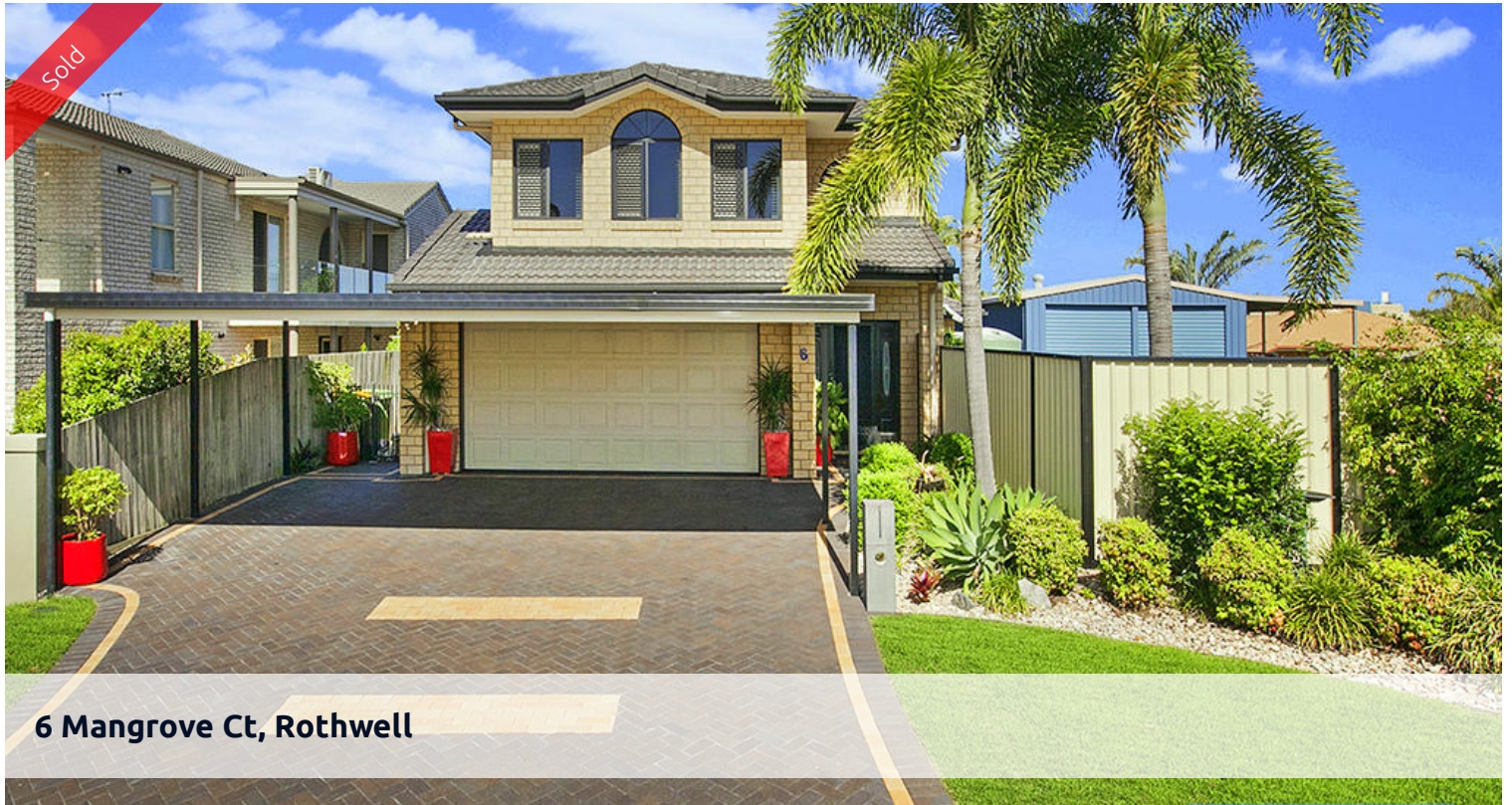
6 Mangrove Ct, Rothwell