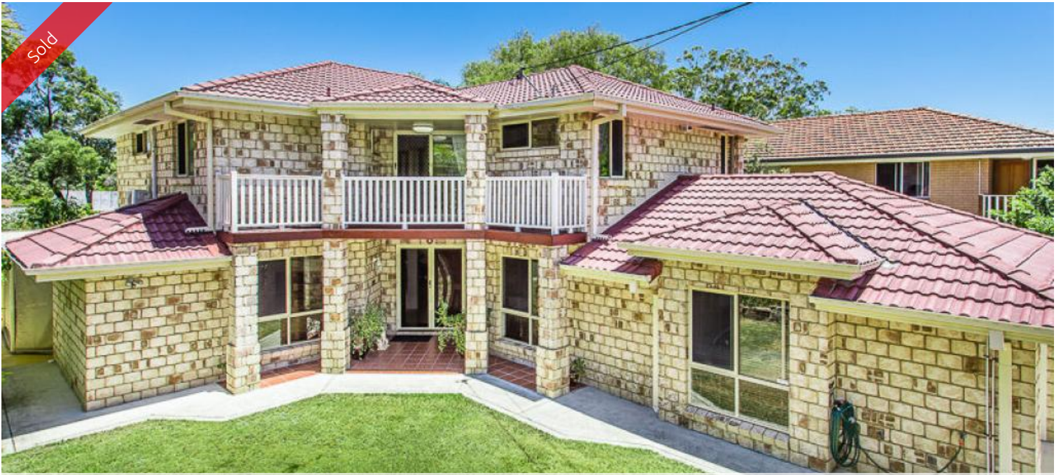
15 Herne Road, Scarborough