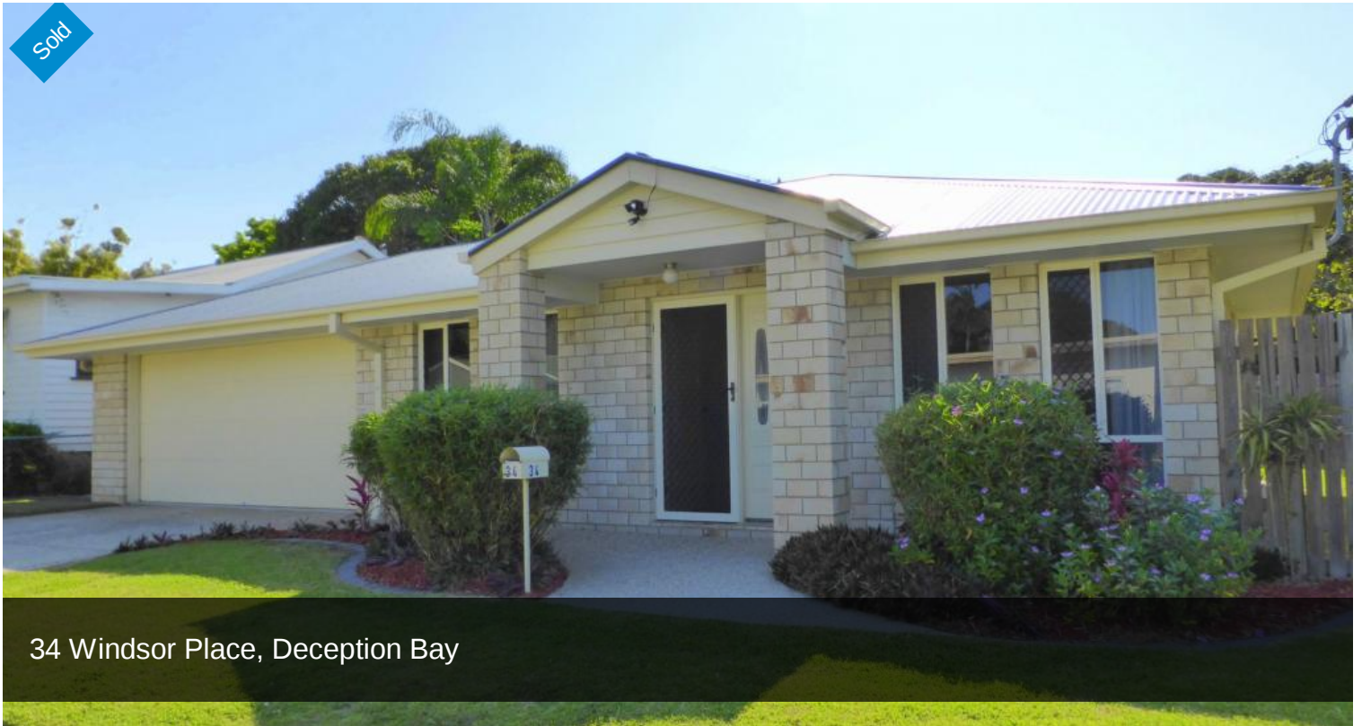
34 Windsor Place, Deception Bay