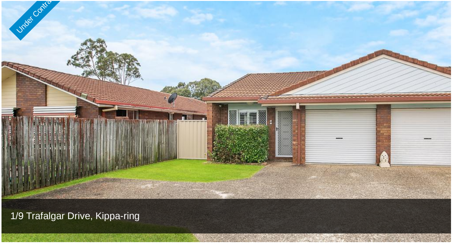
1/9 Trafalgar Drive, Kippa-ring