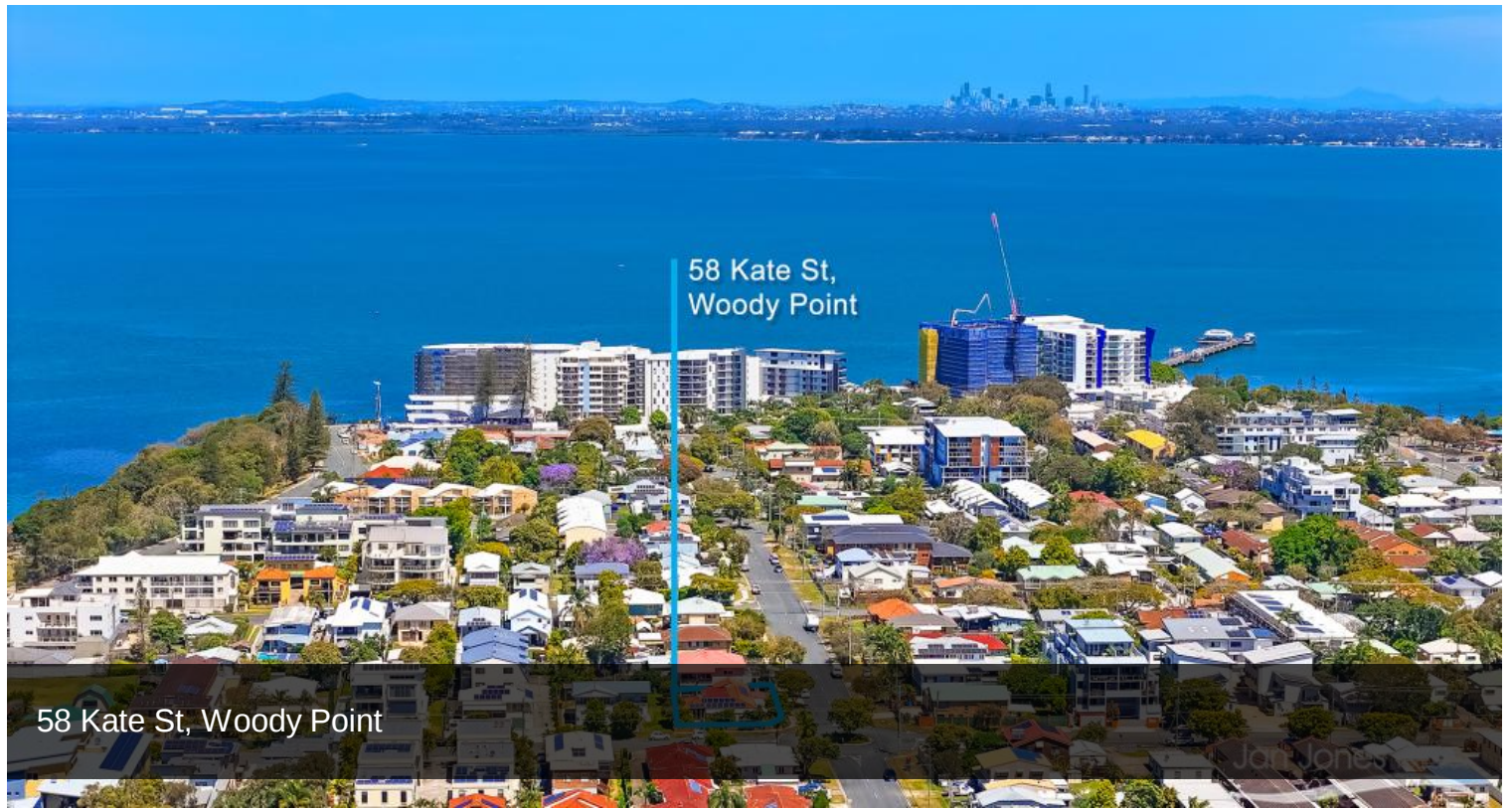
58 Kate St, Woody Point