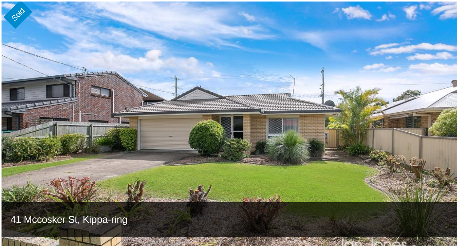
41 Mccosker St, Kippa-ring