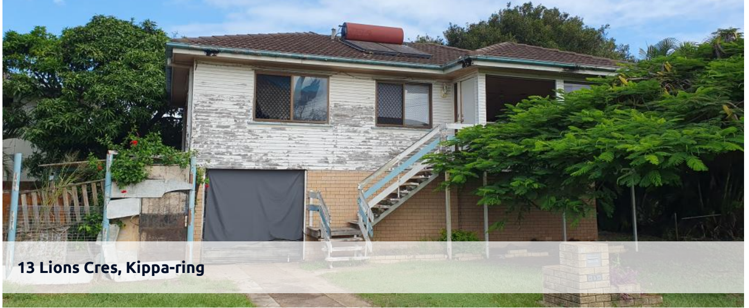
13 Lions Cres, Kippa-ring