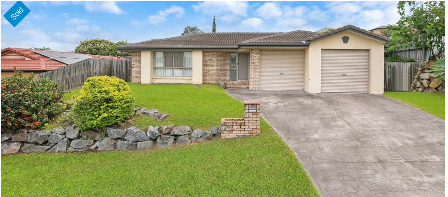
3 Triantha Ct, Albany Creek