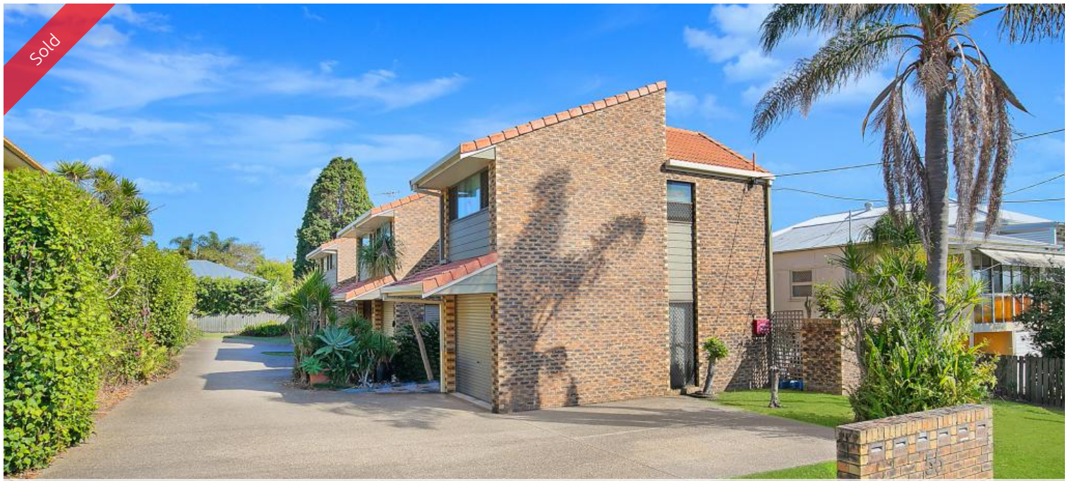
Unit 3, 55 Ernest St, Margate