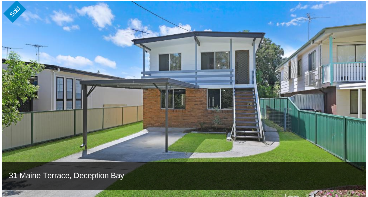
31 Maine Terrace, Deception Bay