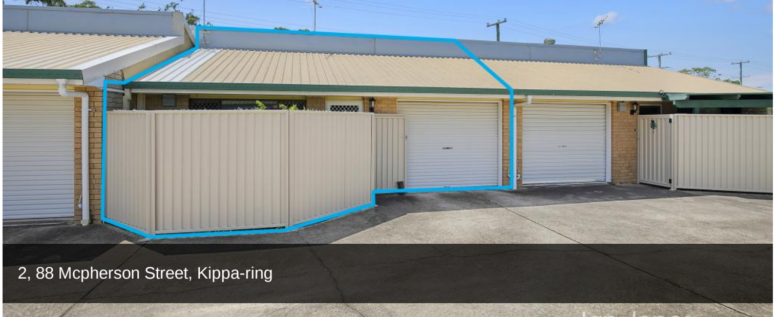
2, 88 Mcpherson Street, Kippa-ring