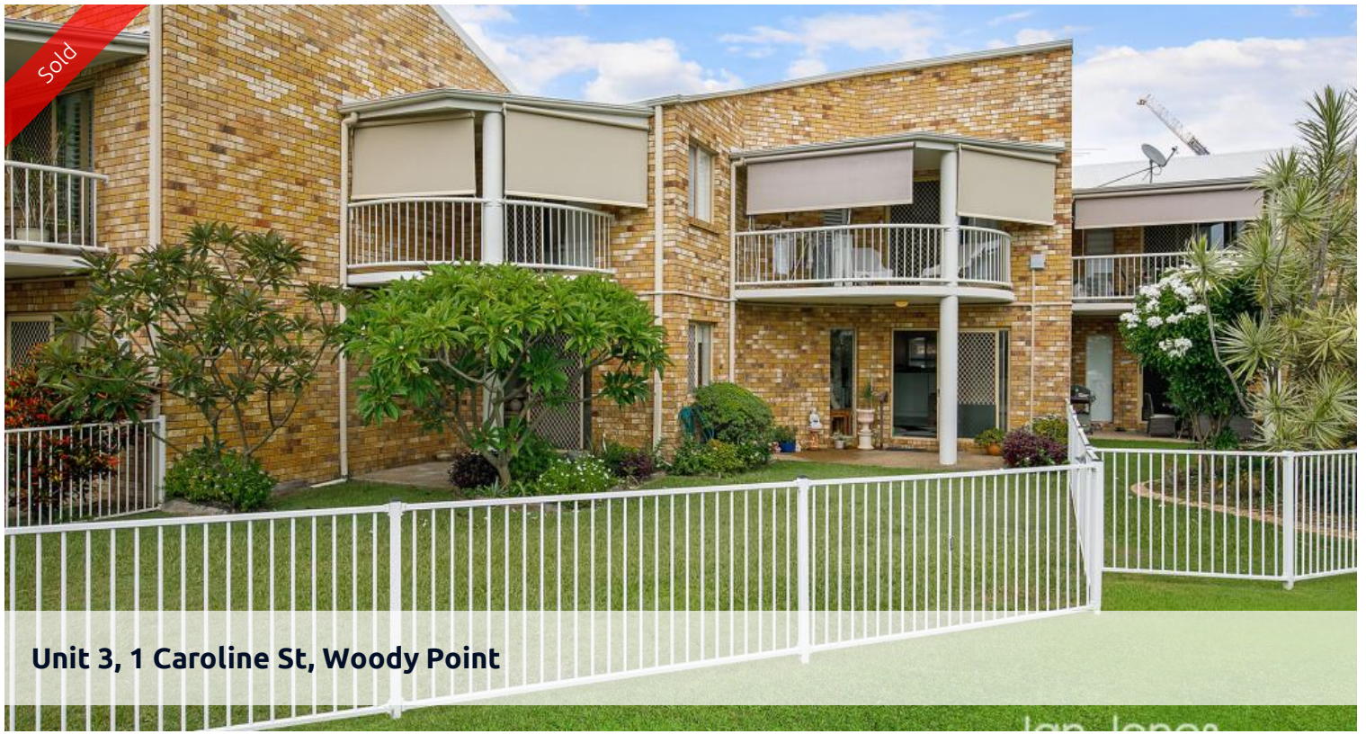
Unit 3, 1 Caroline St, Woody Point