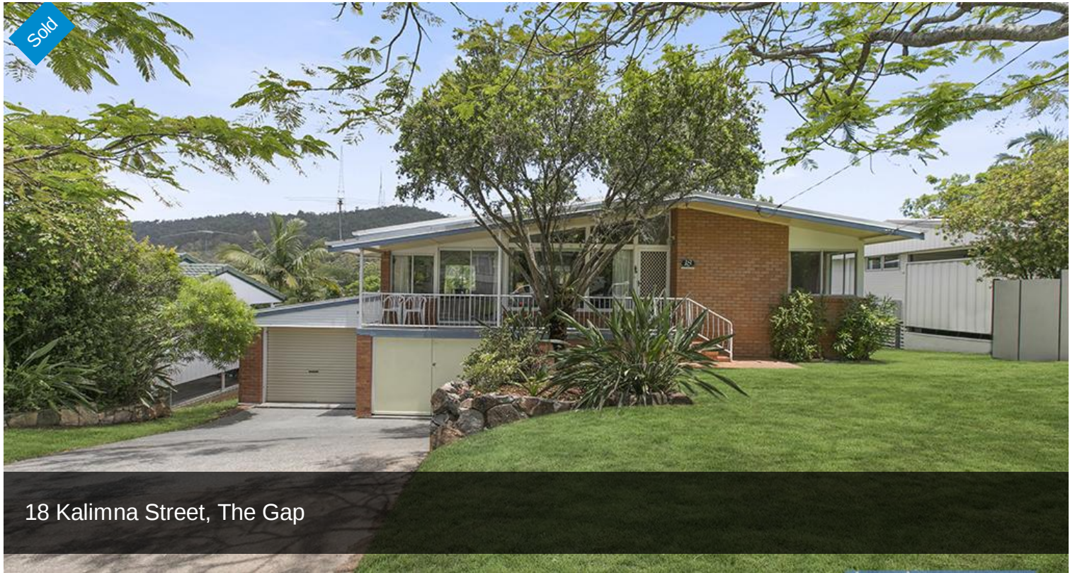
18 Kalimna Street, The Gap