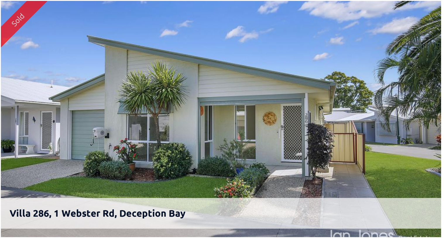
Villa 286, 1 Webster Rd, Deception Bay