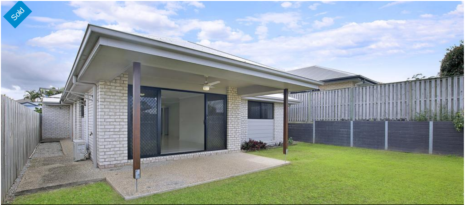
6 Mariana Ct, Mango Hill