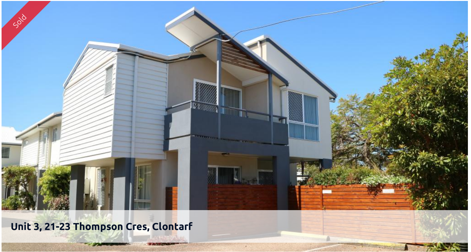
Unit 3, 21-23 Thompson Cres, Clontarf