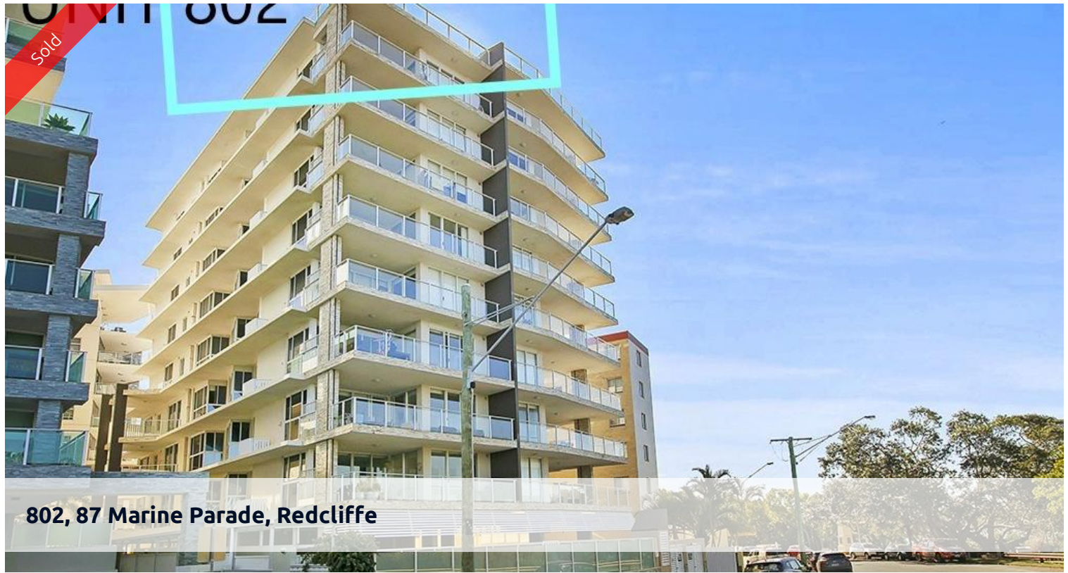
802, 87 Marine Parade, Redcliffe