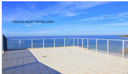
PRIVATE ROOF TOP BALCONY