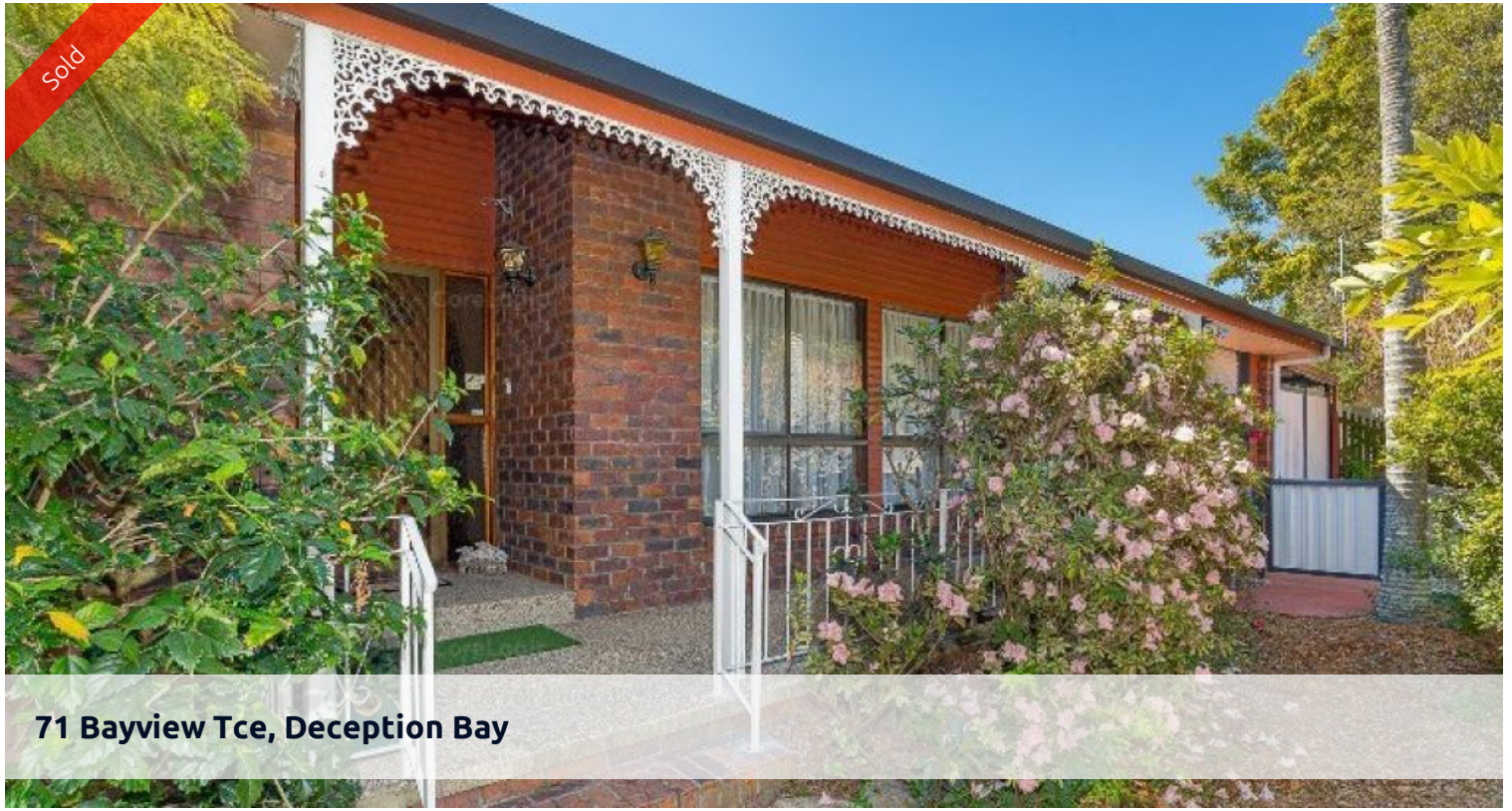
71 Bayview Tce, Deception Bay