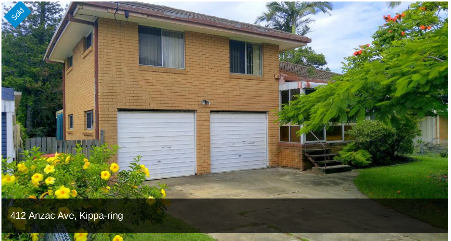
412 Anzac Ave, Kippa-ring