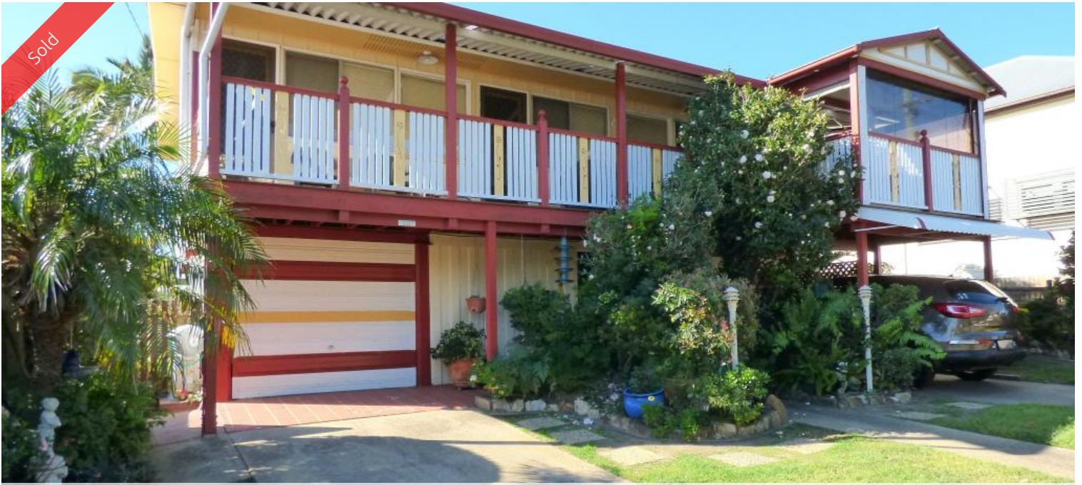
13 Alice St, Clontarf