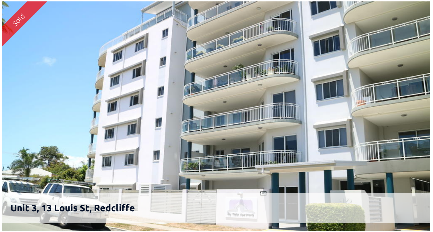
Unit 3, 13 Louis St, Redcliffe