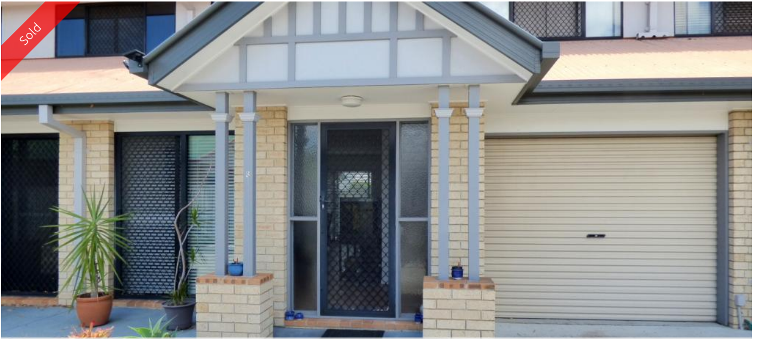
3/47 Dalton St, Kippa-ring