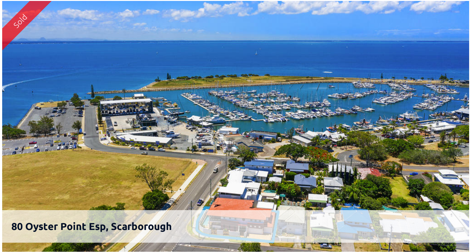
80 Oyster Point Esp, Scarborough