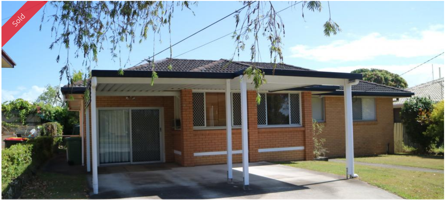
39 Kalimna Dr, Clontarf