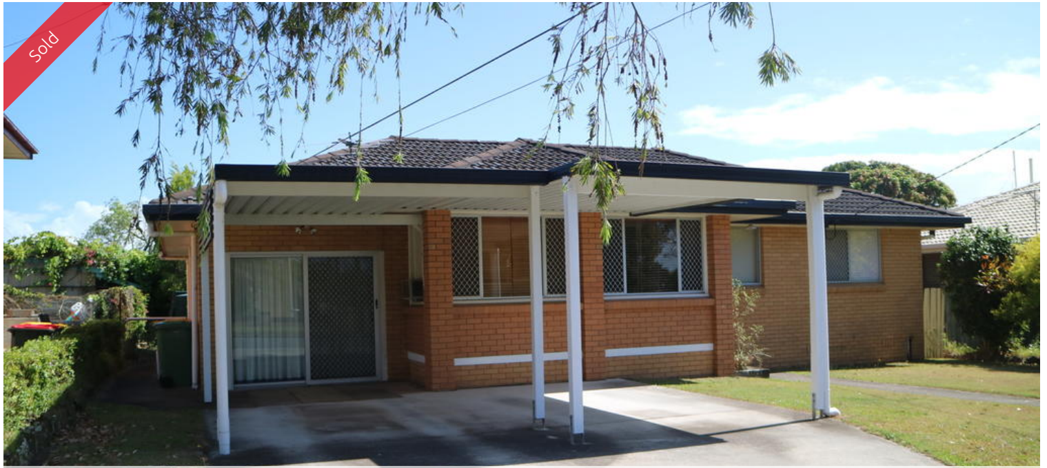
39 Kalimna Dr, Clontarf