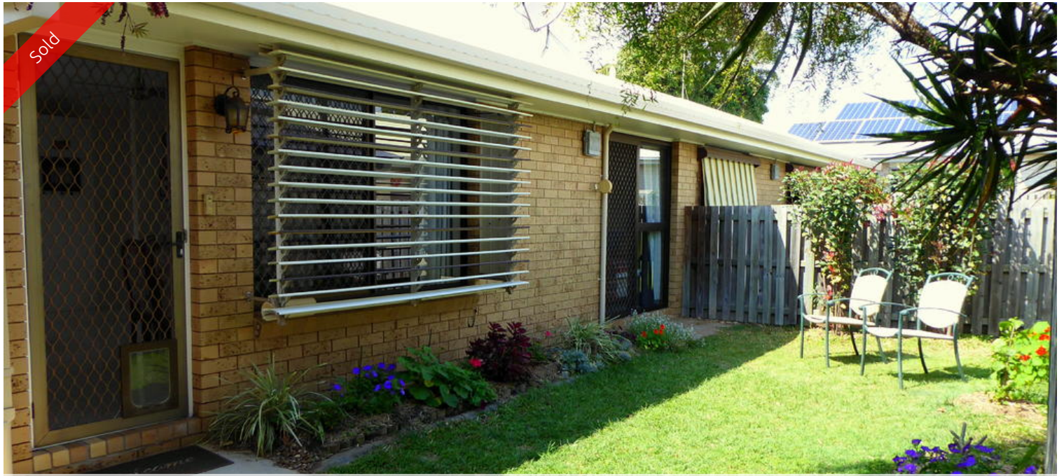
Unit 3, 592 Oxley Ave, Scarborough