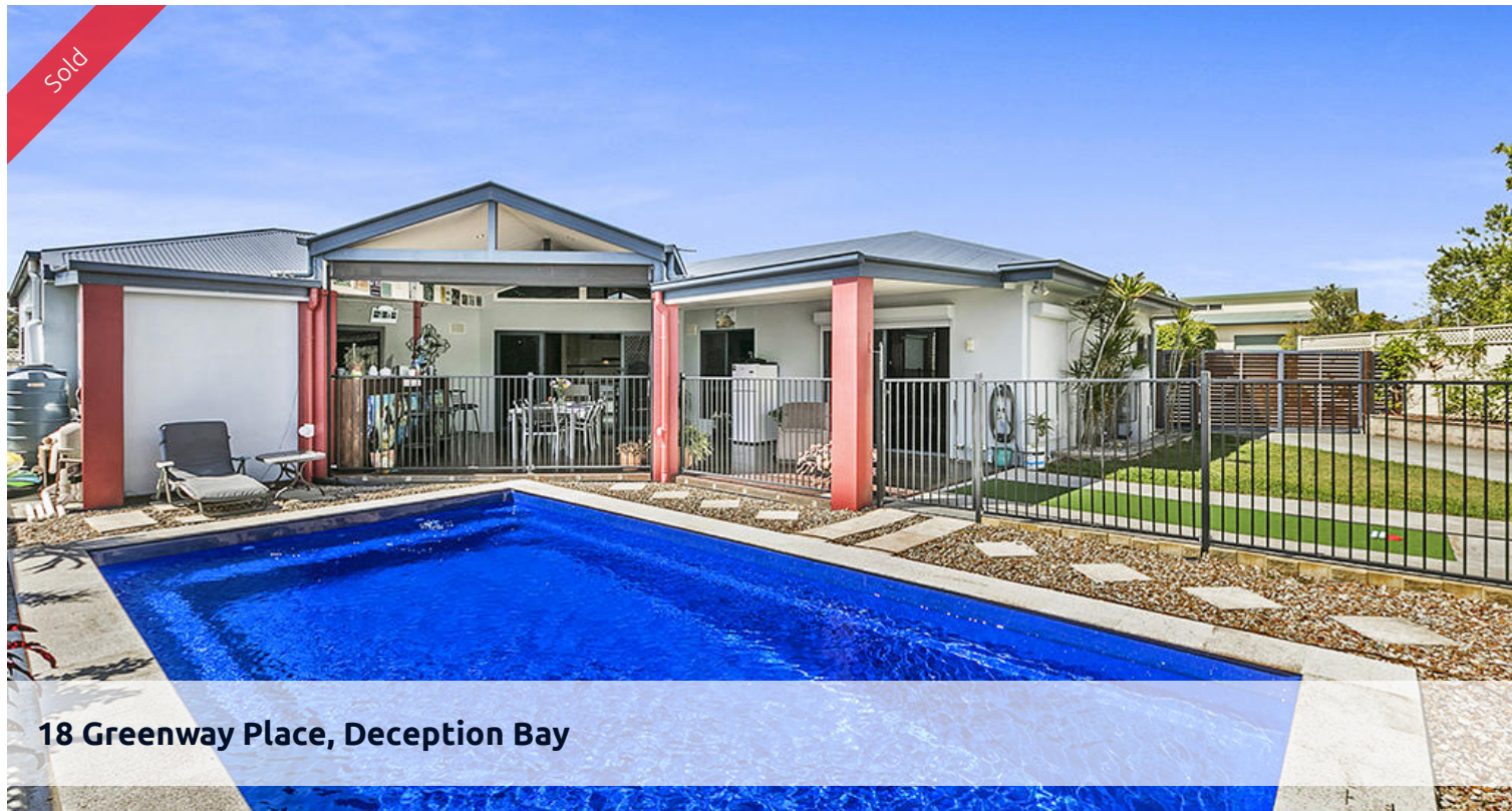
18 Greenway Place, Deception Bay